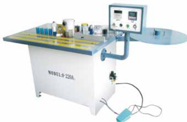
F-220A1 (可加高机头/可封100mm宽的封边带, 加支架, 扩大工作台面)