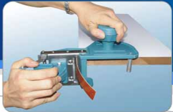
STRAIGHT CUTTING DEVICE 齐头刀(可切直边)