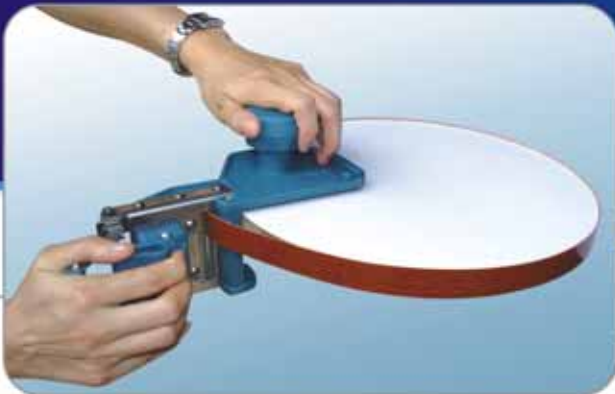
ROUND SGAPE CUTTING DEVICE 齐头刀(可切弧边)