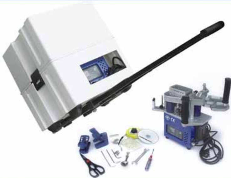
可移动塑料箱 / 铁箱包装 Packing Plastic Box