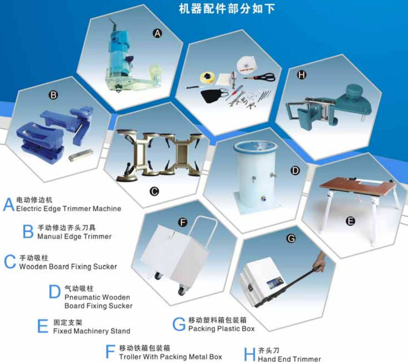
A 电动修边机 Electric Edge Trimmer Machine