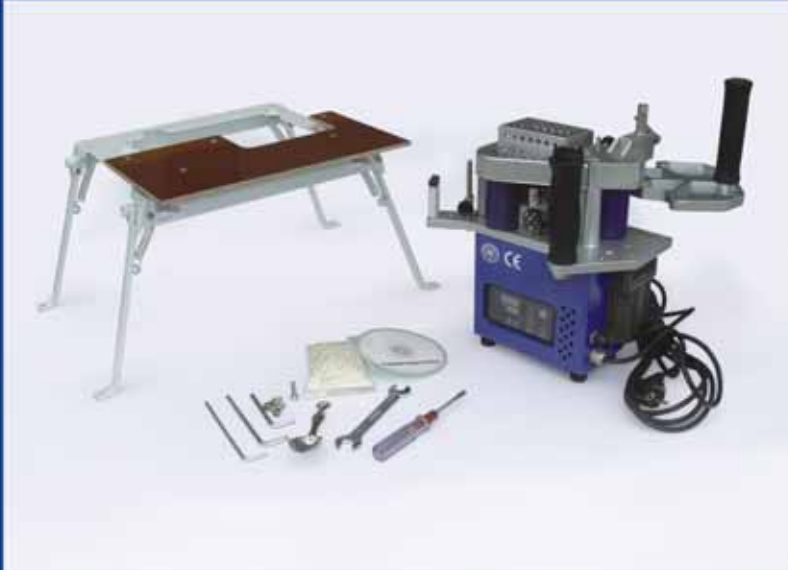
纸箱包装 Canton Box Packing