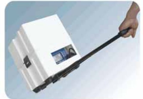
Ak806 ABS Box