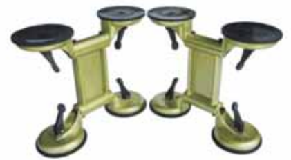
AK801 Suction Cups