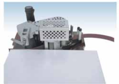
Portable Edge Bander working with table on ABS Box