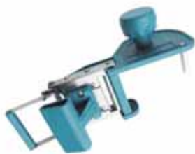
AK804 Hand End Trimmer