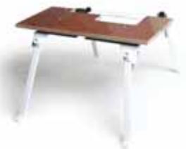
AK805 Fixing Stand

All production within one year warranty after purchasing, during the warranty period, please contact with sales agent for repair or spare parts replacement.