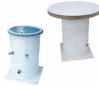
AK802 Pneumatic fixing sucker